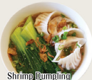
Shrimp Dumpling Egg Noodle Soup 10.10