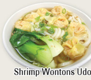
Shrimp Wontons Udon Noodles Soup 10.10

with White Rice or Brown Rice (All Dishes Are Served Steamed without Oil, Salt, or M.S.G.)