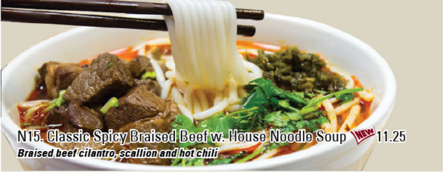
N15. Classic Spicy Braised Beef w. House Noodle Soup NEW 11.25 Braised beef cilantro, scallion and hot chili

Please specify the noodle of your choice: Egg Noodle (Cantonese Thin Noodles), Udon (Japanese Noodles) Chow Fun (Flat Soft Noodles), Mei Fun (Thin Rice Noodles) House Noodle(Thick Rice Noodle)