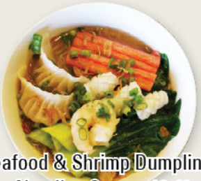
Seafood & Shrimp Dumplings Egg Noodles Soup 10.40