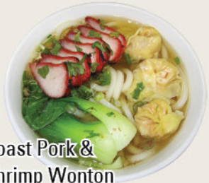
Roast Pork & Shrimp Wonton Udon Noodles Soup 10.10